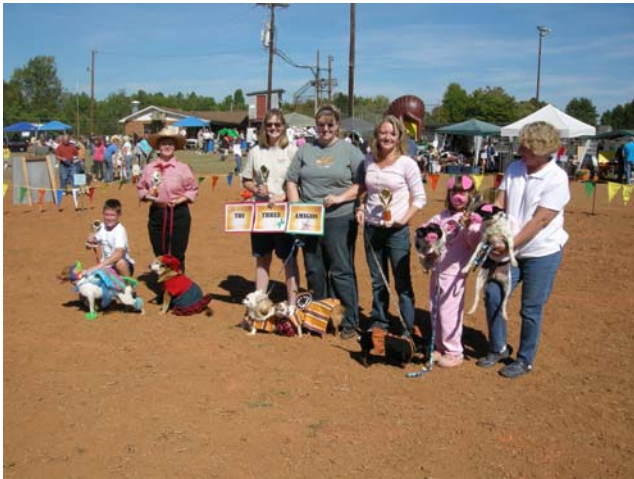
winners of the HSRC sponsored costume contest