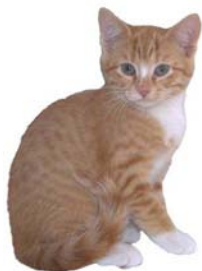
"Charity" (available for adoption)

Humane Society of Randolph County PO Box 4384 Asheboro, NC 27204 www.hsrbcpets.org